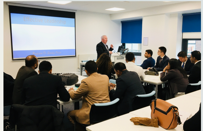
Leadership Workshop at Newcastle Business School, United Kingdom (2019)

Has demonstrated / potential corporate leadership capability.